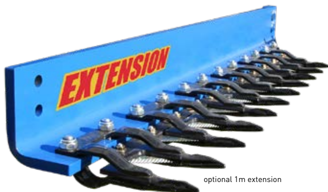
optional 1m extension